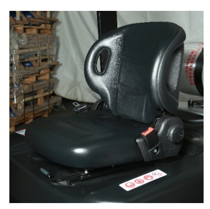
Built-in occupancy sensor in the seat will prevent the lift truck from moving without an operator.