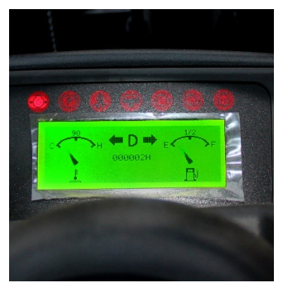
Multifunctional LED panel with hour meter to monitor timely maintenance.