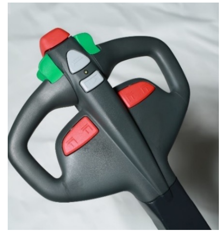
Operator protection button for safe operation. Tortoise function to protect the operator and load in narrow aisles