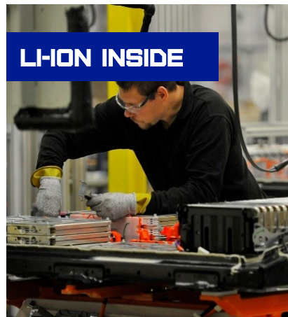
2 times more efficient operation due to Batteries with Li-ION technology