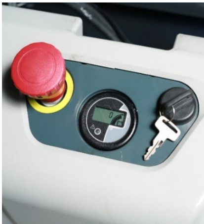
Emergency button, charge indicator and ignition key in the operator's field of view