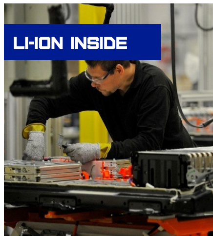
2 times more efficient operation due to Batteries with Li-ION technology