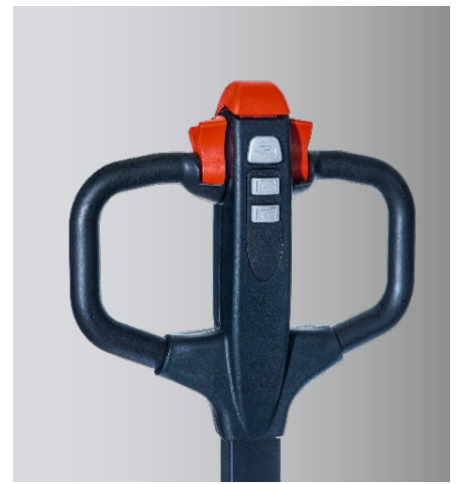
Operator and load protection button for safe operation in narrow aisles