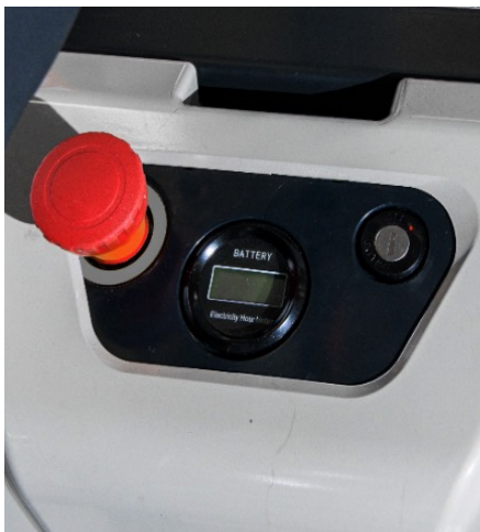
Emergency button, USB port, magnetic ignition key and charger wire in the operator's line of sight