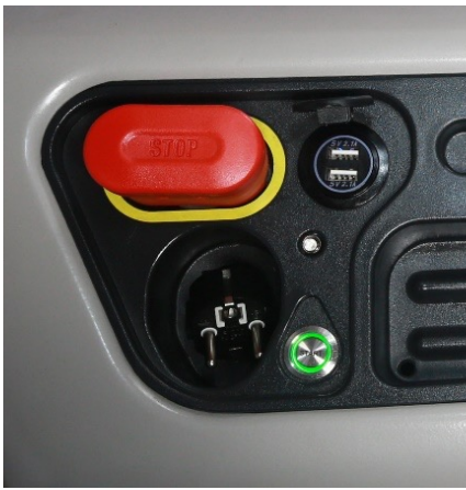
Emergency button, USB port, magnetic ignition key and charger wire in the operator's line of sight