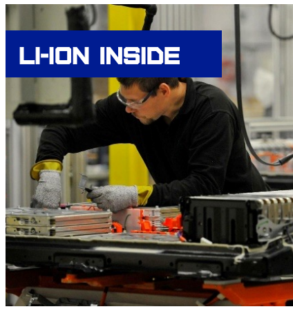
2 times more efficient operation due to Batteries with Li-ION technology