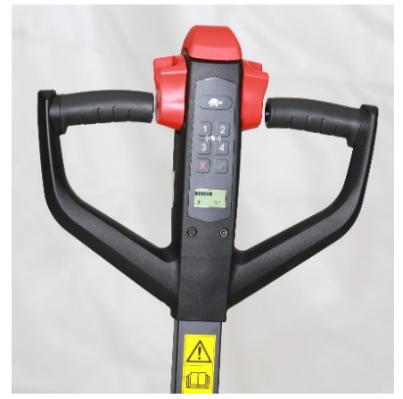
Operator protection button for safe operation. Tortoise function to protect the operator and load in narrow aisles