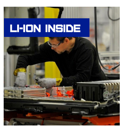
2 times more efficient operation due to Battery with Li-ION technology.