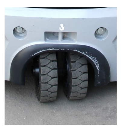
Increased steering angle of the twin rear wheels gives the loader maximum maneuverability.