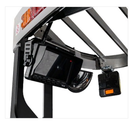
The TISEL FORKVIEW SYSTEM is a video monitoring system with a 7-inch high-definition color monitor for fork position monitoring.