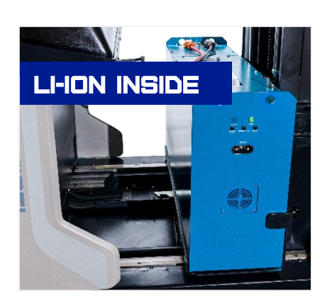
2 times more efficient operation due to Battery with Li-ION technology.